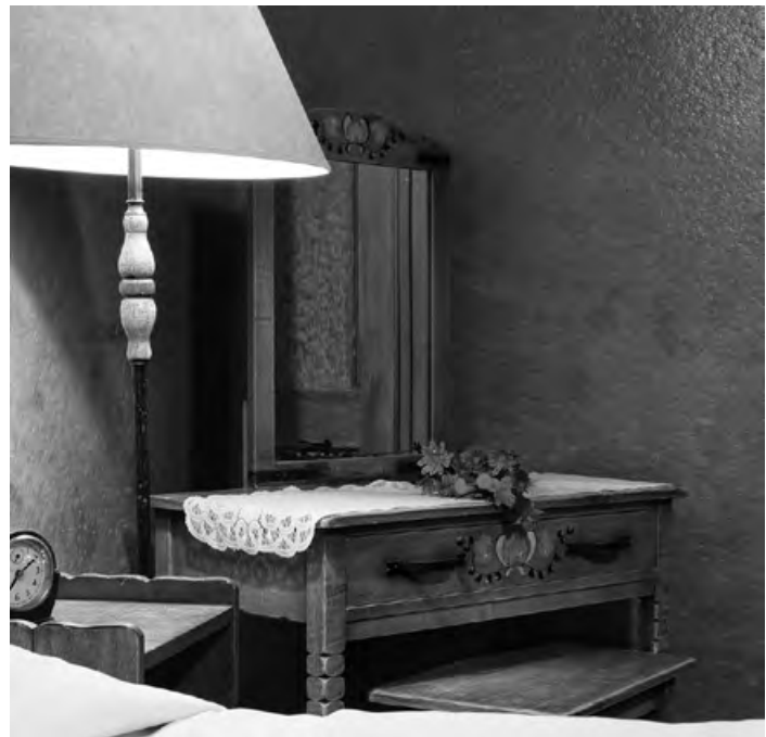
The rustic style Oregon Caves Chateau contains the largest collection of Oregon alder-crafted Monterey furniture in the nation.

The Chateau comprises the largest single collection of Monterey Furniture in the country. Wildly popular when it was manufactured from 1929 – 1943, the furniture was crafted from Oregon alder in the early “Spanish revival” style. Many pieces include leather and/or