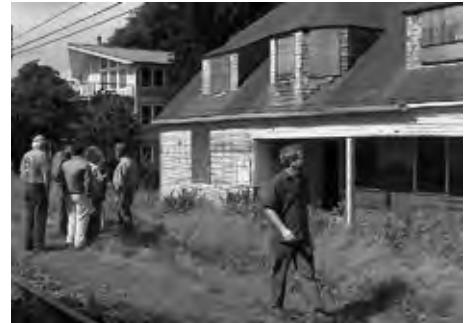
The Historic Preservation League of Oregon drew attention to endangered places, including the Coos Bay's Egyptian Theater (left), Eugene's Civic Stadium (top right), and the Tillamook Bay Lifesaving Station (bottom right).